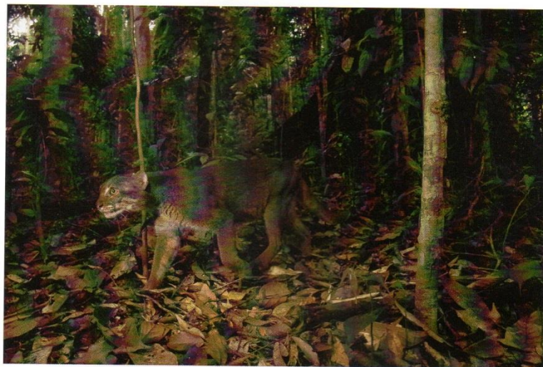
Fig. 2. Borneo bay cat.

Information on each species's natural history remains too scanty to determine the minimum landscape size each needs, and how much forest degradation and fragmentation (as distinct from conversion, which evidently is tolerated only by leopard cat) each can accommodate. South-east Asian forest has been encroached too fast for simple inspection of which species persist in forest-blocks of different sizes to be useful: many populations left over from former optimal conditions