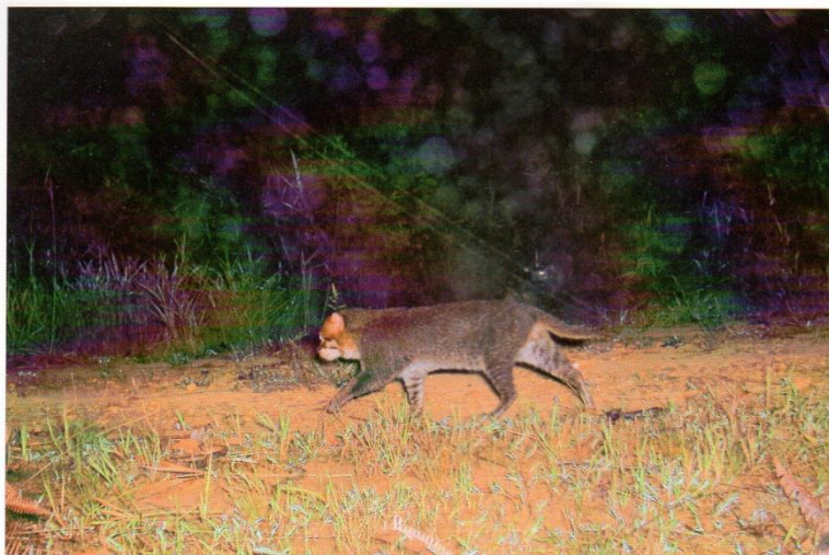
Fig. 3. Flat-headed cat.

year, particularly if they continue in multiple years, would be unlikely to arise from methodological changes, which are more likely to generate conflicting trends between years and sites. Such a collation might detect major changes in abundance. While no substitute for a specifically designed – but therefore specific resource-demanding – monitoring programme, the present baseline alternative is no monitoring at all.