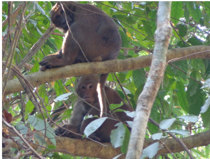
Plate 1. Assamese macaque ( Macaca assamensis ).

in and around the stream water (locally called chara ) in study area. Semi-aquatic mammals occupy the intermediate position between terrestrial and aquatic mammals (Fish & Baudinette, 1999); more specifically can be said semi-aquatic mammals are those that are primarily terrestrial but that spend a large amount of time under water, either as part of their life cycle or as an essential behavior (e.g., feeding) ( https://en.wikipedia.org/wiki/List_of_semiaquatic_tetrapods ).