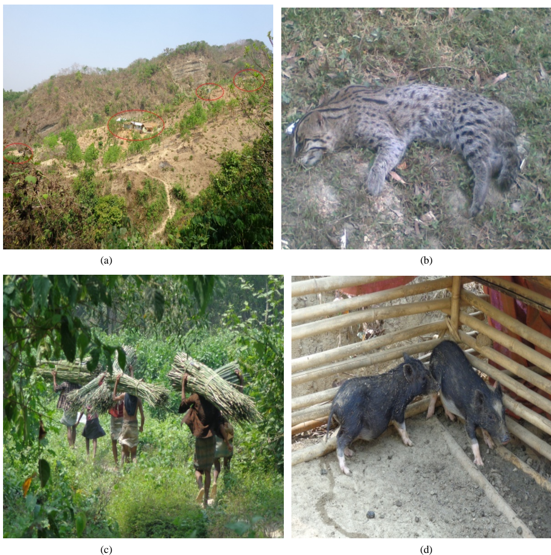
Plate 2. Some threats of the BNP. (a) Partial view of tribal colony; (b) Fishing Cat killed by locals using poisonous bait; (c) Local people collecting bamboos; (d) Rearing of Wild Boar.

and others programs. Furthermore, these people often use poisonous bait to kill carnivore mammals for conserving their poultry and livestock. During the study period, a dead body of Fishing Cat was found nearby forest edge that ate poisonous food baited by locals ( Plate 2(b) ).