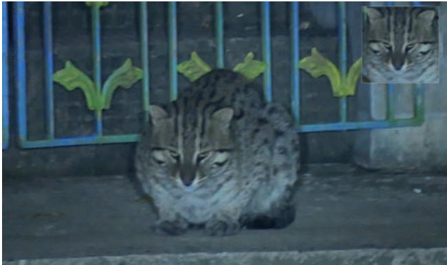
Fig. 6. Fishing cat sitting in front of a house highlights the proximity at which people and fishing cats live in the Kalabansh area.