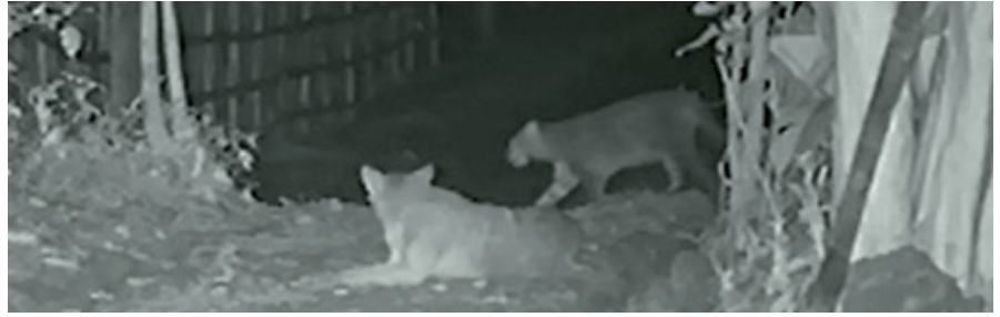
Fig. 5. Fishing cat crossing a path while a golden jackal sits watching. No antagonistic behaviours were recorded between the two species and, after the fishing cat passed, the golden jackal moved to the place where the fishing cat fed on a fish and ate the remains (see SOM V1).