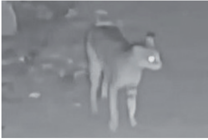
Fig. 4. Jungle cat in the Kalbansh village, Howrah District, walking towards a bridge a few hours after a fishing cat crossed the bridge (SOM F1).