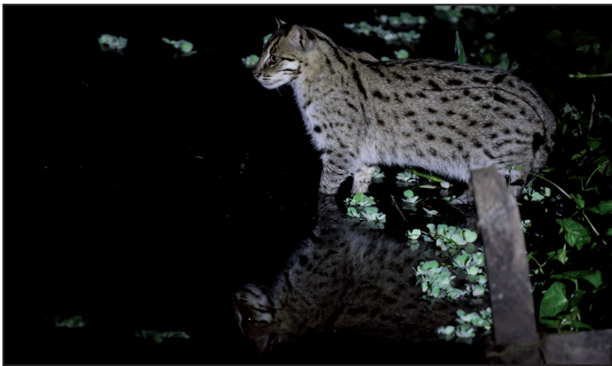
Fig. 2. A fishing cat stalking prey in a privately-owned fish pond in Kalbansh village of Amta Block, West Bengal, India.

activities: (1) they set up a travel company called Forest Dwellers that offers specialised wildlife tours in West Bengal and the North Eastern States of India; (2) they established Bhagrol Basa Home Stay as an independent unit that offers photographic tours focused on fishing cats; and (3) they set up Harbes Nest another home stay unit that focuses on Red Pandas. 20% of their profits from 1, 2 and 3 are channelled into an NGO that they set up called WATER – Wildlife Awareness Trust for Environment and Research. The fishing cat project is financed by WATER. Shantanu Prasad and his team at Bhagrol Basa drive tourists at night time on specific routes into an unprotected area of water-