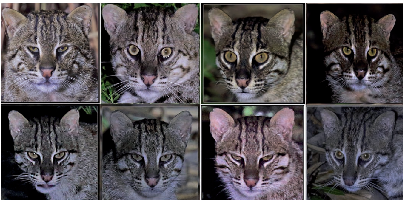
Fig. 3. Profile pictures of individual fishing cats, identified by their unique facial markings, scars and whisker patterns.

Over 2,000 fishing cat photos made during night drives between March 2016 and January 2019 reveal 19 individual cats living with-in the 30 km 2 area. Videos were also made using camera traps. These photos and videos provide qualitative insights into the behaviour of fishing cats in this area, their interactions with other carnivores, and their dependence on fish ponds (Figs. 4–6; Supporting Online Material SOM Figures F1–F4, Videos V1–V3). Fishing cats with cubs (Fig. 7) were also recorded on three occasions, suggesting that these human-use areas have favourable sites for fishing cats to den and raise young.