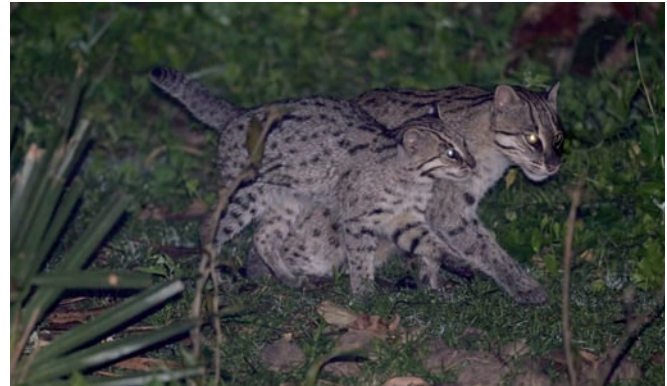
Fig. 7. Fishing cat with three cubs was photographed in March 2019 by a tourist Mr Robin Hamilton near Bhagrol Basa.

cat can adapt well to living in close proximity to humans in West Bengal. Whilst protected areas continue to be essential for the conservation of cat species, adaptable species like the fishing cat can live alongside humans where there is tolerance to coexist and suitable habitat.