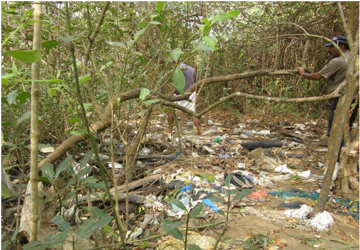
Trash washed into and trapped in a mangrove patch in Kozhikode.