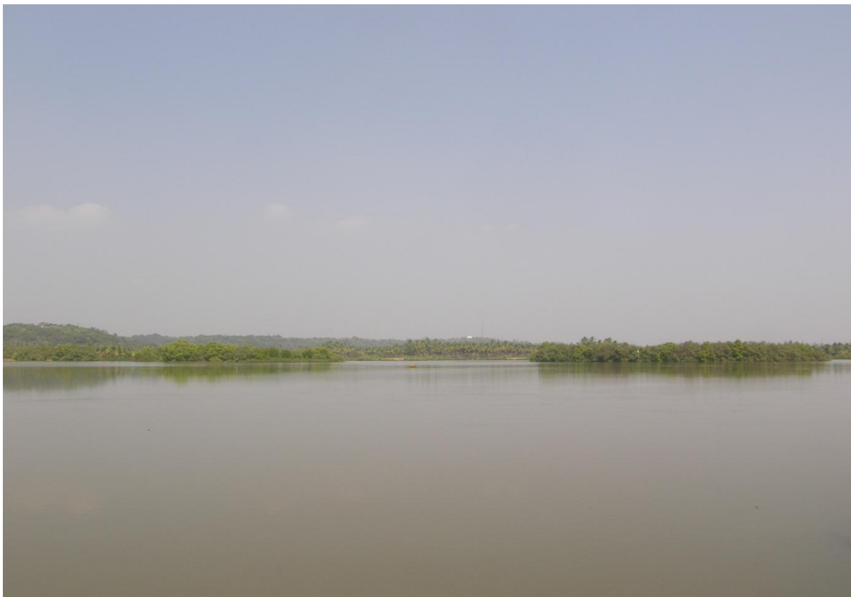
Kayal with small mangrove islands in Pazhyangadi, Kannur.