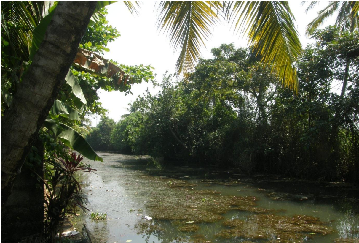
Canal in Alleppey. The canals were not just polluted and clogged but there were no large fish in them that could sustain a 12-15 kg cat.