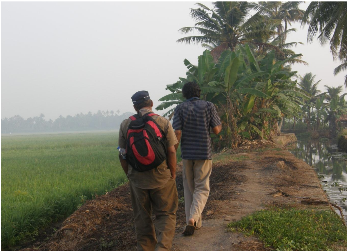
Canal and paddy fields in Alleppey.