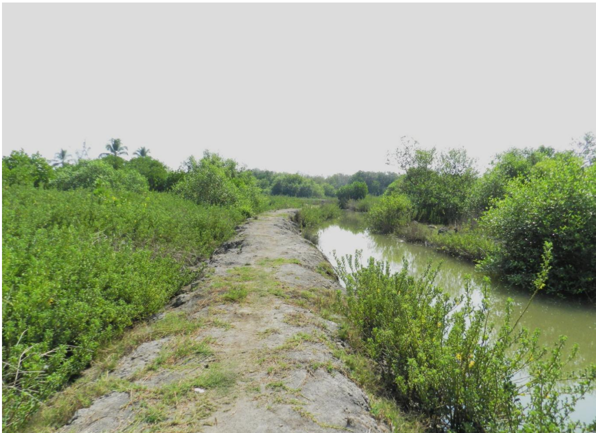
Mangroves in Kannur. Many such patches of mangrove are converted to aquaculture or paddy fields. Some are later abandoned.

In the Kannur, Kozhikode, Kottayam and Trivandrum districts we surveyed mangroves, aquaculture farms, paddy fields, lakes or 'Kayals' and small wetlands. We also surveyed the backwater canal systems in Alleppey district.