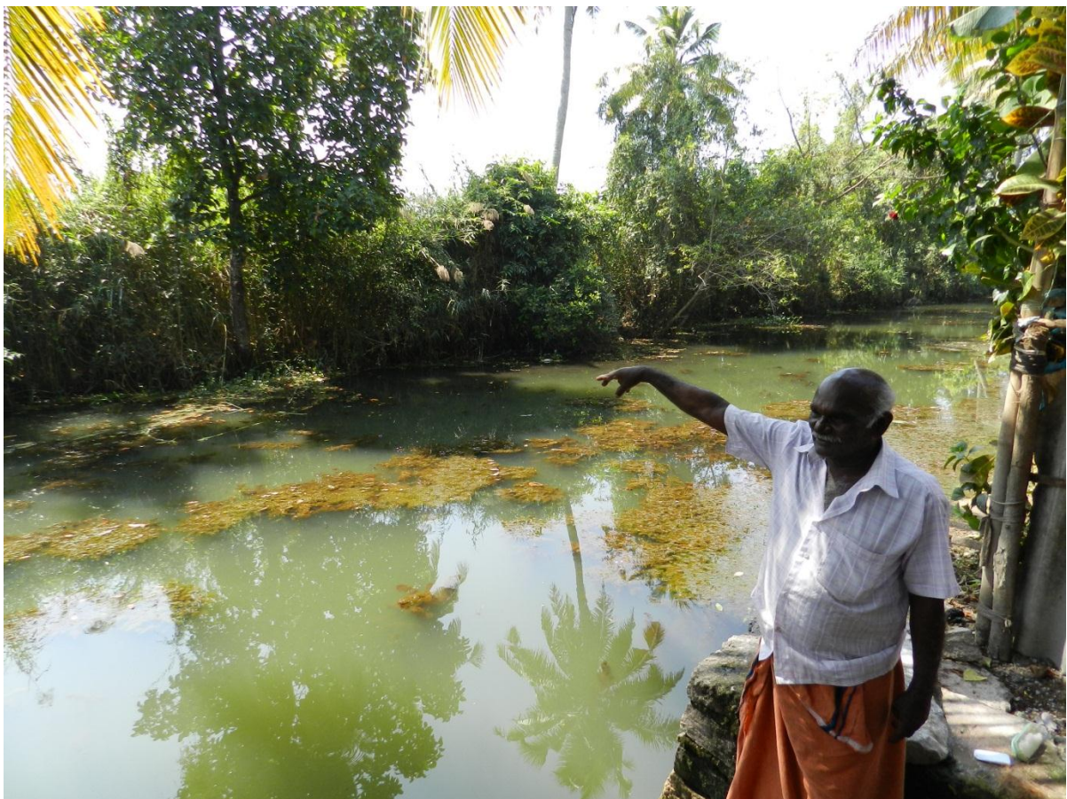
Local showing a patch opposite his house in Alleppey where a wild cat visits regularly. He said the cat comes to catch fish but the description he gave of the cat (big ears and long legs) matched the jungle cat.

Information obtained from locals did not suggest the presence of fishing cats in the areas surveyed since there was no local name for the species and all descriptions of cats that they were aware of in their locality matched with jungle cat.