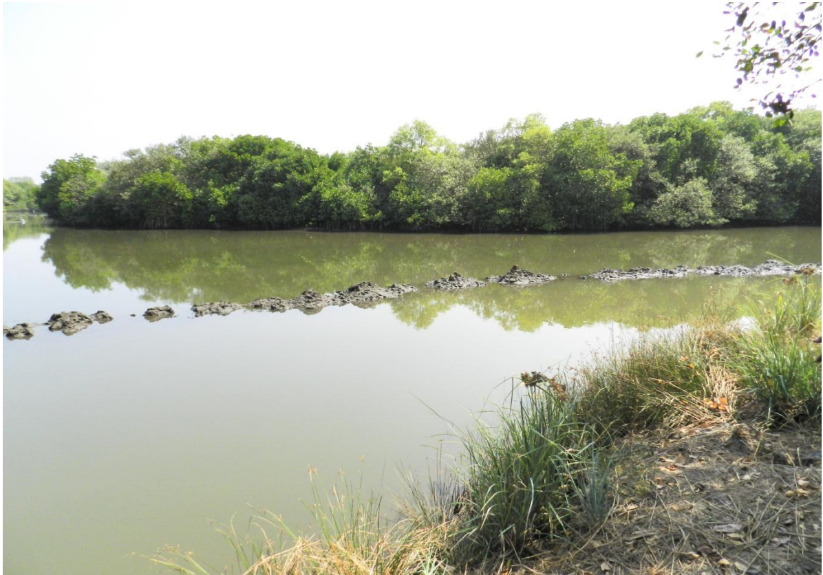
Abandoned aquaculture farm in Kannur district. Originally this was a mangrove patch.