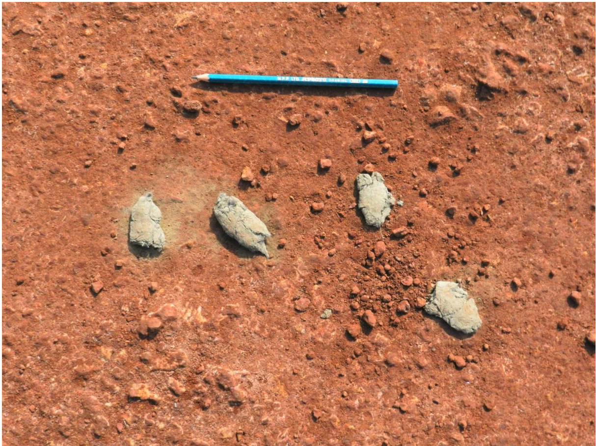
Scats along an aquaculture farm in Kannur. Laboratory analysis of scats from here assigned them to jungle cat.

A total of 53 scats were collected. Of these 14 were positive for felids. Restriction digestions were carried out on 10 scats. Four scats had insufficient predator DNA after amplification with felid primers and were not included in the restriction digestions. We could identify 6 Jungle cats and 2 house cats from the restriction digestion profiles. Restriction profiles of PCR products from two scats did not give clear results and were classified as unknown. No scat was assigned to fishing cat.