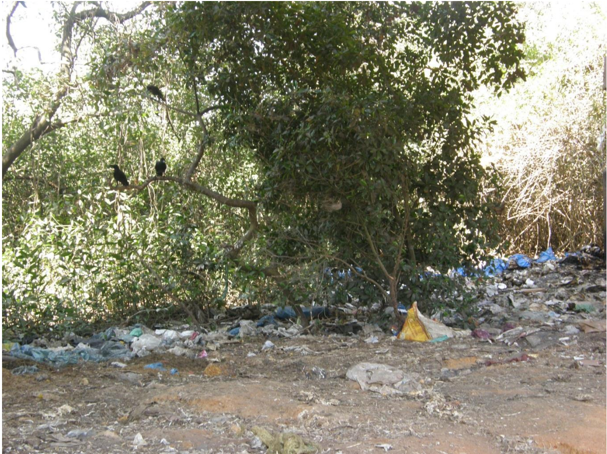
Trash in a mangrove patch in Kannur